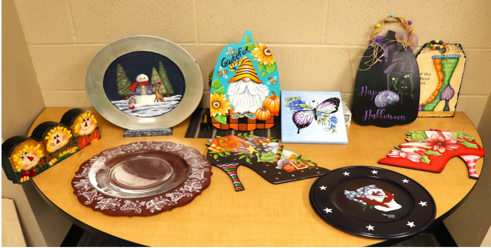
Show and Share