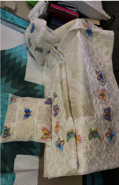
Pictures of the beautiful Quilt we are selling chances on for our raffle in October.